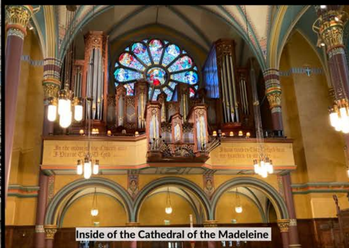
Inside of the Cathedral of the Madeleine

The Communiqué is published bi-monthly by the Council of Catholic Women | Archdiocese of Detroit.