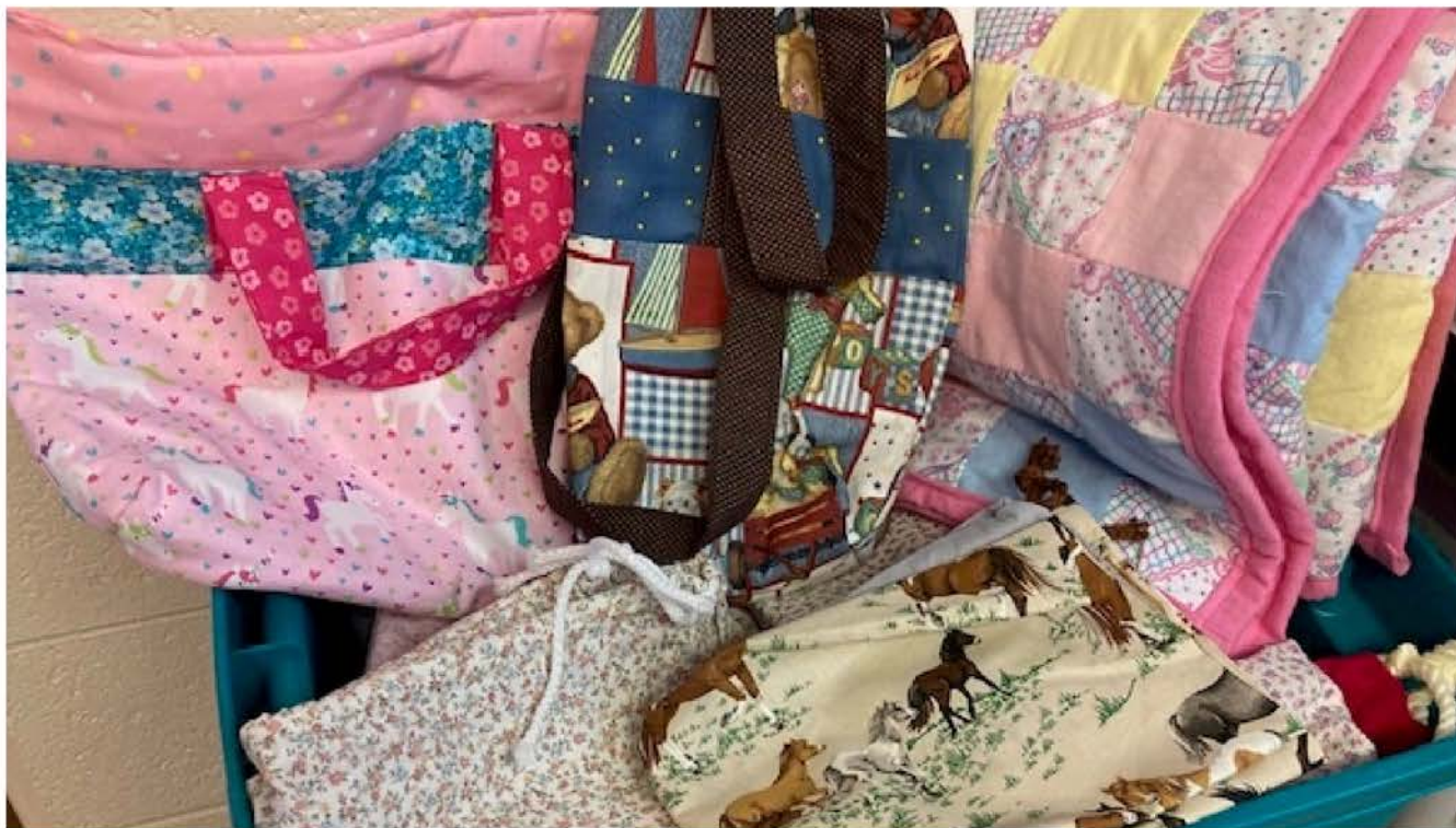
More of the beautiful hand sewn bags from the Retired and Senior Volunteer Program (RSVP) sewers from Catholic Charities and AmeriCorps Seniors

Donations will be picking up again with Right to Life month and the Christmas season coming up. We've been so blessed with donations that we will hopefully be able to distribute a few more layettes per month. We just need to find out where the need is. Please, if you know of a group or an individual who could use our layettes, just reach out to me. I always have a few extra layettes made up, just in case!