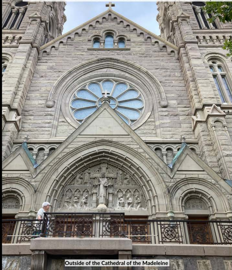
Outside of the Cathedral of the Madeleine