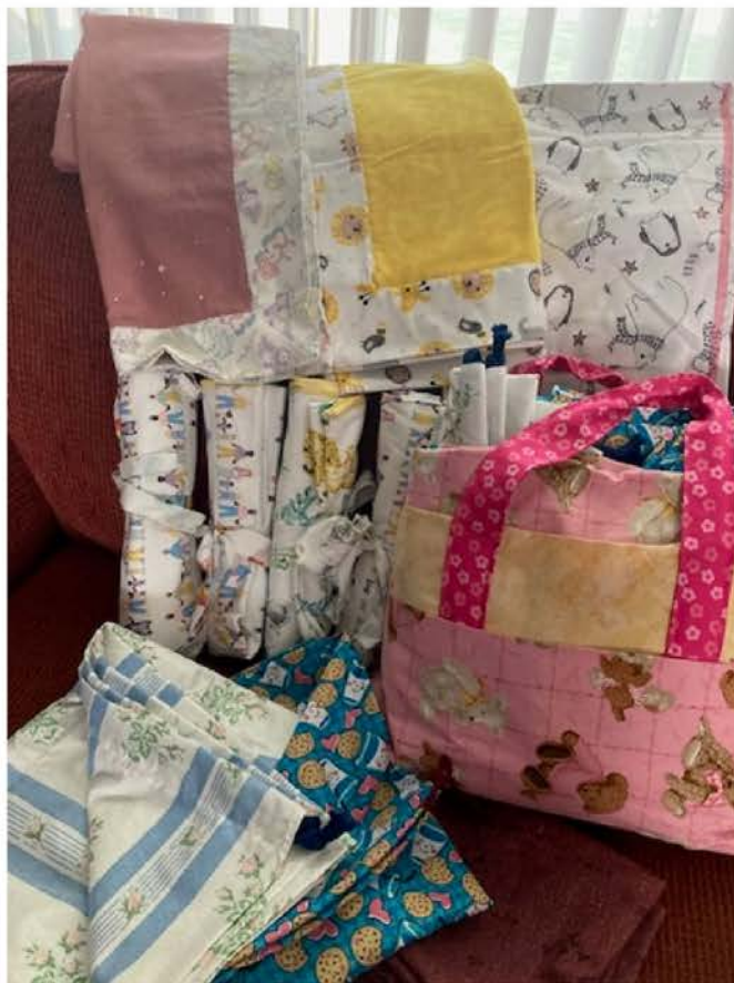
The beautiful handiwork of the Retired and Senior Volunteer Program (RSVP) sewers from Catholic Charities and AmeriCorps Seniors